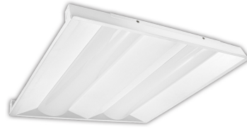
2' X 2'