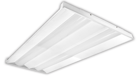
2' X 4'